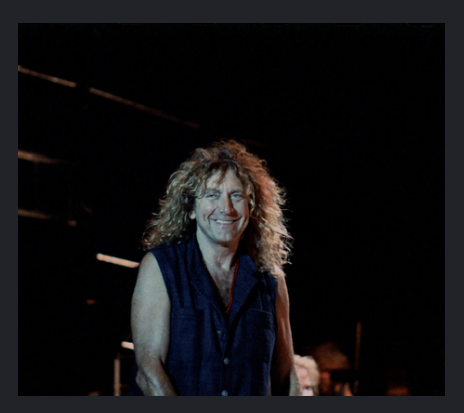
Who will you find...